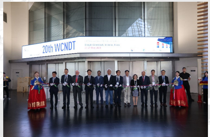
Cutting-the-tape ceremony for the official opening of the 20th WCNDT exhibition

including two ICNDT General Assembly meetings, Working Group meetings, ICNDT Executives and SIG meetings, and workshops on NDT Frontiers, Certification bodies, and SIG of NDT Reliability and Human Factors. The Conference was followed by ISO meetings on Saturday, June 1 st and Sunday, June 2 nd .