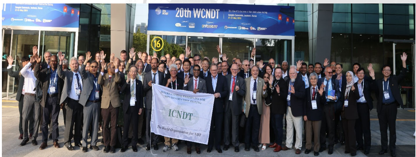
Delegates attending the ICNDT General Assembly in Incheon

20 th WCNDT homepage link www.20thwcndt.com