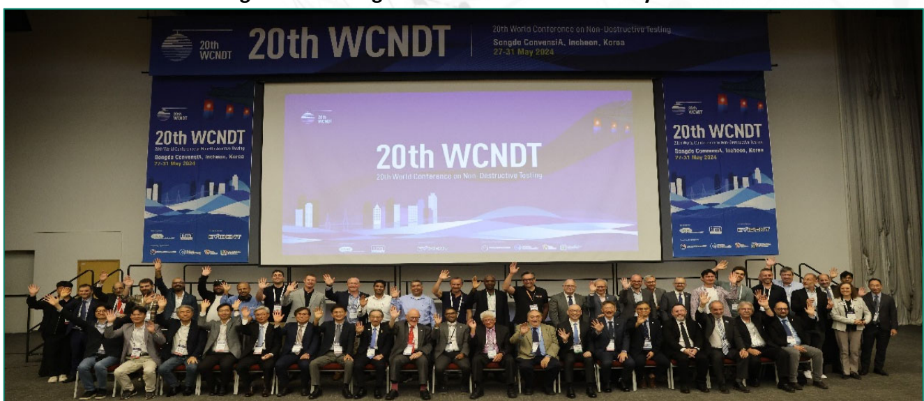
Delegates waving farewell at the closing ceremony