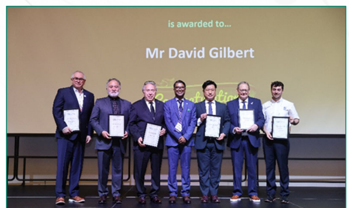
Winners of ICNDT Awards